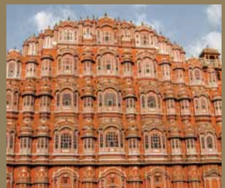
Hawa Mahal, the Palace of Winds

We can't wait to go back: there is so much more to experience and next time we won't leave it so long.