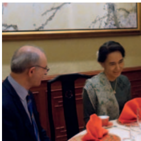
PACES in Myanmar