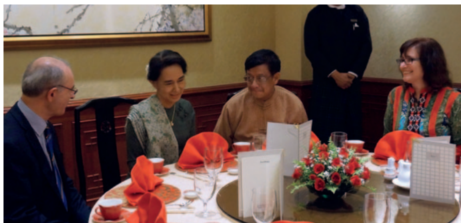
Nobel prize winner, Aung San Su Kyi, attended the Federation dinner in Myanmar