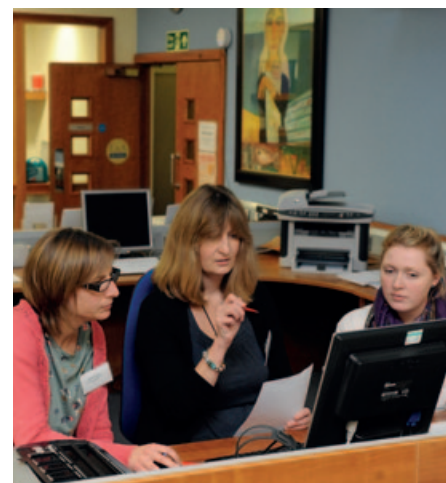
Students on the Foundation course.

We look forward to welcoming as many of you as possible to Glasgow. Social activities include the Admission Ceremony for new members, a 5K "Clinicians on the Clyde" charity fun run for which, at the age of 66, I am already in training, a social event in the Glasgow Science Centre and a Triennial Ball in the City's Kelvingrove Art Galleries. We hope there will be a Faculty table at the Ball. Ladies should bring dancing shoes since Scottish Country dancing and high heels do not go well together. The injury rate for male partners is too high!