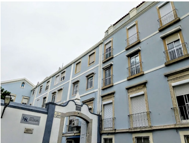
t Louis Hospital, Lisbon, Portugal